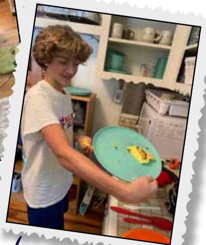
Learning chemistry through cooking - Yum!