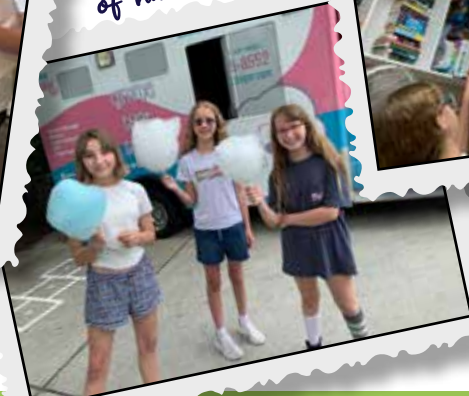
Celebrating a year of lots of hard work!