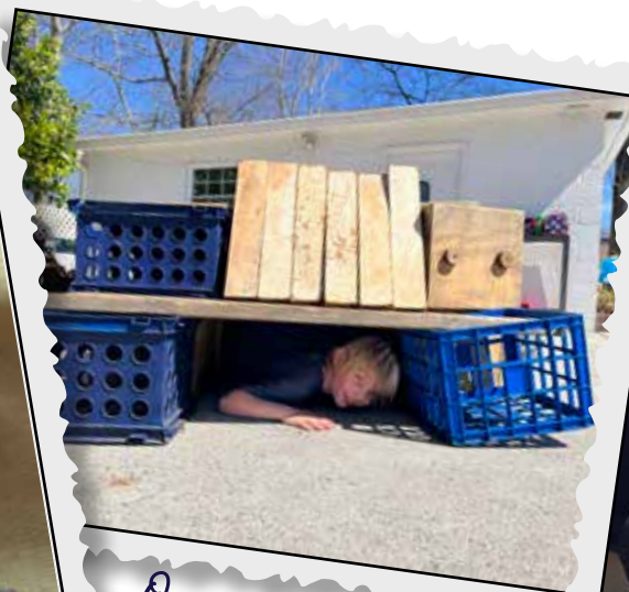
Open-ended, loose parts play is the best!