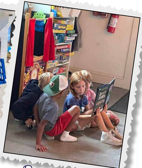
Reading with friends!