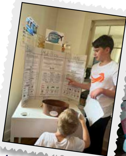
Working on real-world presentation skills

Students earn leadership badges through community mentoring and explore their gifts and talents through apprenticeships.