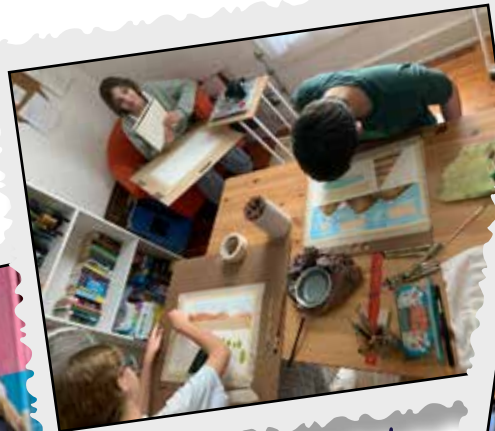
Artists hard at work!